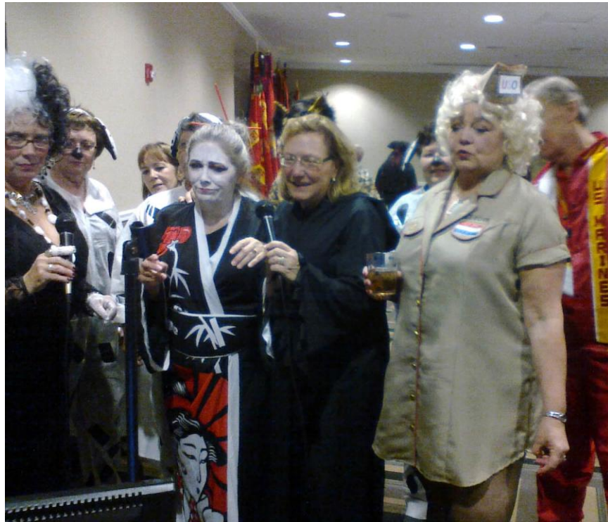
"THE GALS OF SCARY KARAOKE"

Below are some photos of the auction . . .